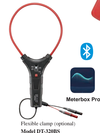
Flexible clamp (optional) Model DT-320BS