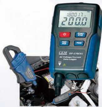
DT-175CV1 AC Current & Voltage Datalogger (P220)