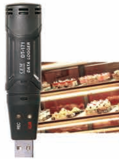
DT-171 Humidity & Temperature Datalogger (P285)