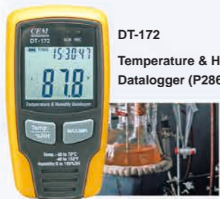
DT-172 Temperature & Humidity Datalogger (P286)