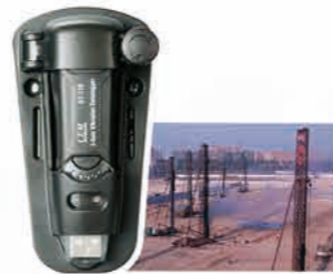
DT-178A 3-Axis Vibration Datalogger (P289)