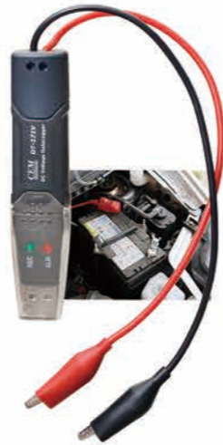
DT-171V DC Voltage Datalogger (P286)