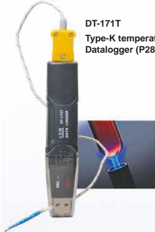
DT-171T Type-K temperature Datalogger (P285)