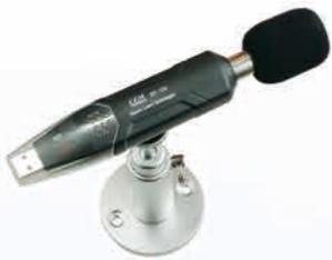
DT-173 Sound Level Datalogger (P287)