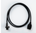
Digimatic Leitung Datentaste, 1m 959149 UVP: 47,00 €*