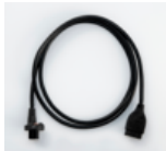
Digimatic Leitung Datentaste, 2m 959150 UVP: 55,00 €*