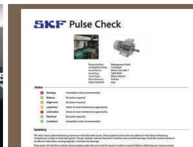
SKF Pulse Check reports

For more information, contact your SKF Representative, email skf.connected@skf.com or visit skfusa.com/skfpulse .