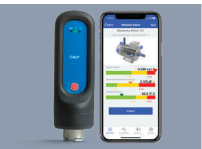
Measure vibration and temperature

CMDT 391-EX-PRO-K-SL CMDT 391-EX-K-SL kit plus: CMAC 8010-EX accelerometer cable CMSS 786A-IS accelerometer CMAC 3715 BNC adaptor CMAC 8011 carry case