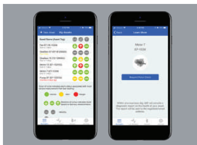
Monitor asset health