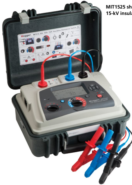
MIT1525 shown with 15-kV insulated clip leadset