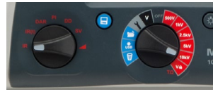
Easy-to-read rotary switch buttons for intuitive field use.