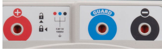
CATIV 1000 V rating on MIT1525 unit's terminals, shown above. The MIT515, MIT525, and MIT025 are rated CATIV 600 on all terminals.