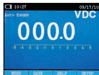
High Resolution & Accuracy