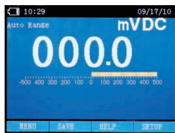
Fast response time