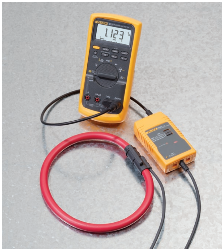
i2000 Flex connected to a Fluke 87V Digital Multimeter.