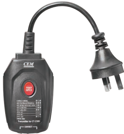
Model CT-230B Transmitter