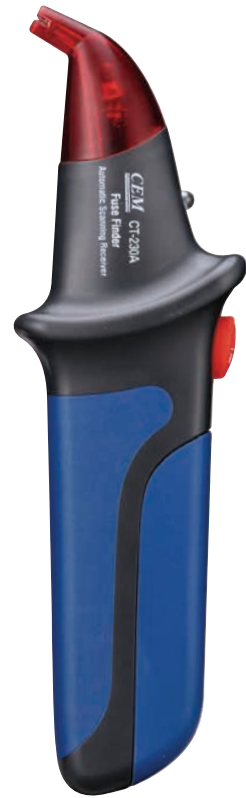
Model CT-230A Receiver