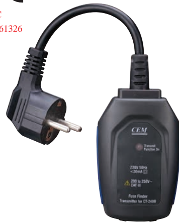
Model CT-240B Transmitter