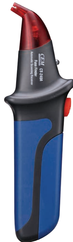
Model CT-240A Receiver