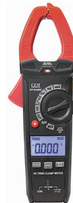
Model 9180C (Single molded plastic housing)

Accessories: Test leads, gift box with carrying case, Temperature probe and 1.5V AAA x 3 batteries